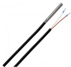
KP/E Cable temperature sensor with PVC cable