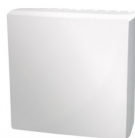
RF/E Room Temperature Sensor