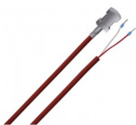
LF1/E Contacting Temperature Sensor with Silicone Cable and Clamping Band