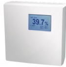
RRF/A Humidity transducer for indoors