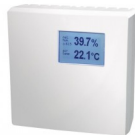
RRFT/A Humidity / temperature transducer for indoors