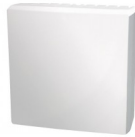
RF/E Room Temperature Sensor