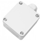
AF1/E Outdoor temperature sensor