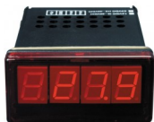
DT/G Digital display