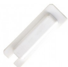
#FS9515 Self-adhesive fixing cap