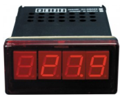
DT/G Digital display