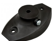
MFL/E Mounting flange