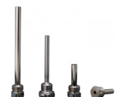
ZT/E Immersion sleeve