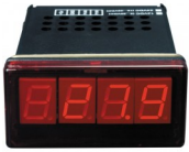
DT/G Digital display